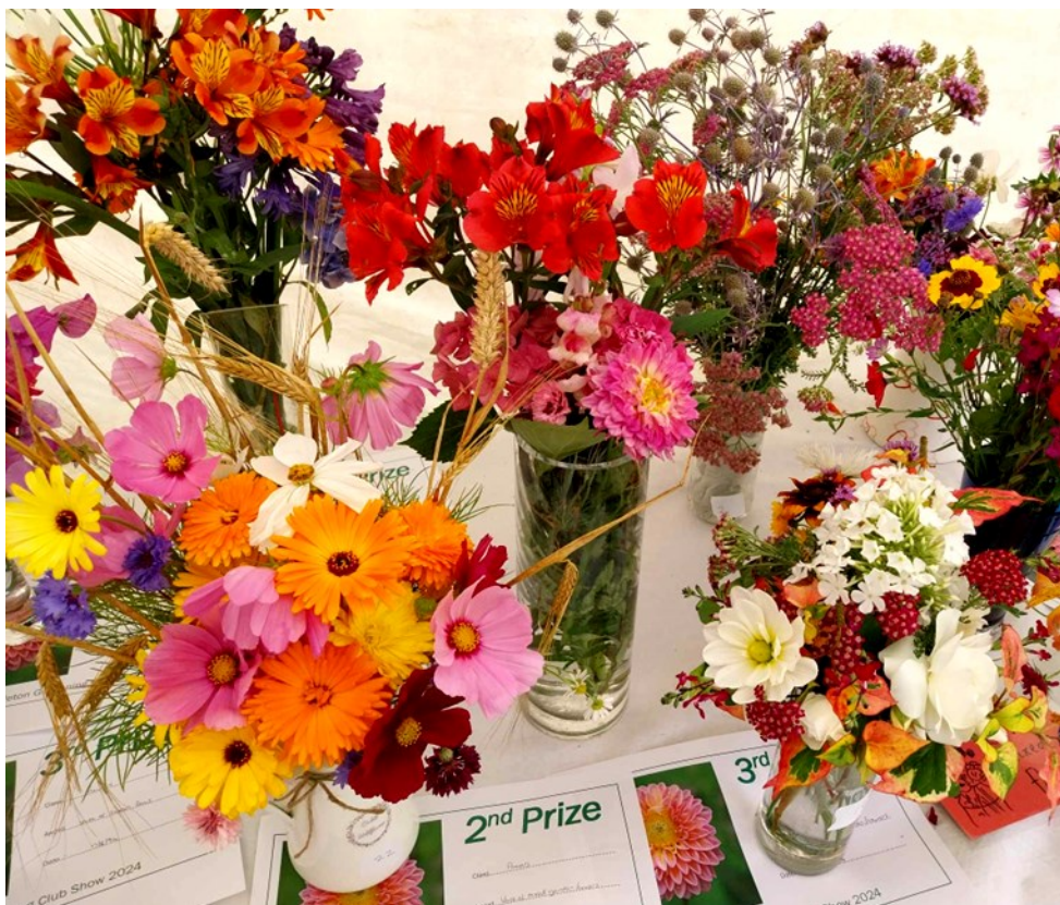
Entries at Hambleton Garden Club show 2024 - see P.5 for more!